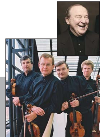
Pražák Quartet/Menahem Pressler

Their superb musicianship has been a highlight of many seasons since they first played for us in 1986. They are known for that warm, mellow, burnished Bohemian sound that makes for incomparable playing of the music of their birthplace. The indefatigable Menahem Pressler is well known to our audience and looks forward to this collaboration – you may remember they played together in our 50th anniversary concerts.